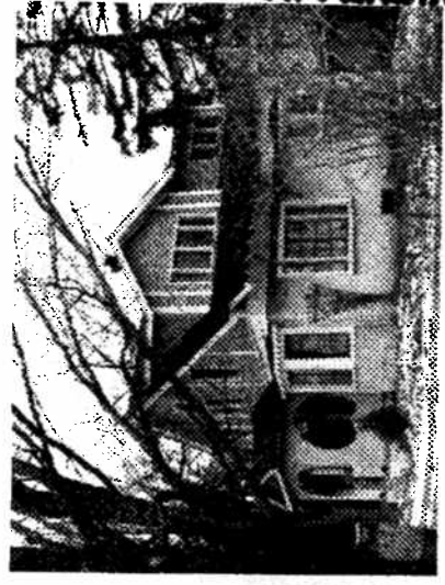
86 John Street