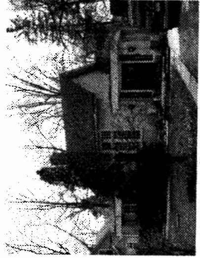
11 Colborne Street