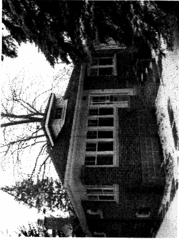
94 John Street

Prominent exterior fireplace chimney with small windows on either side