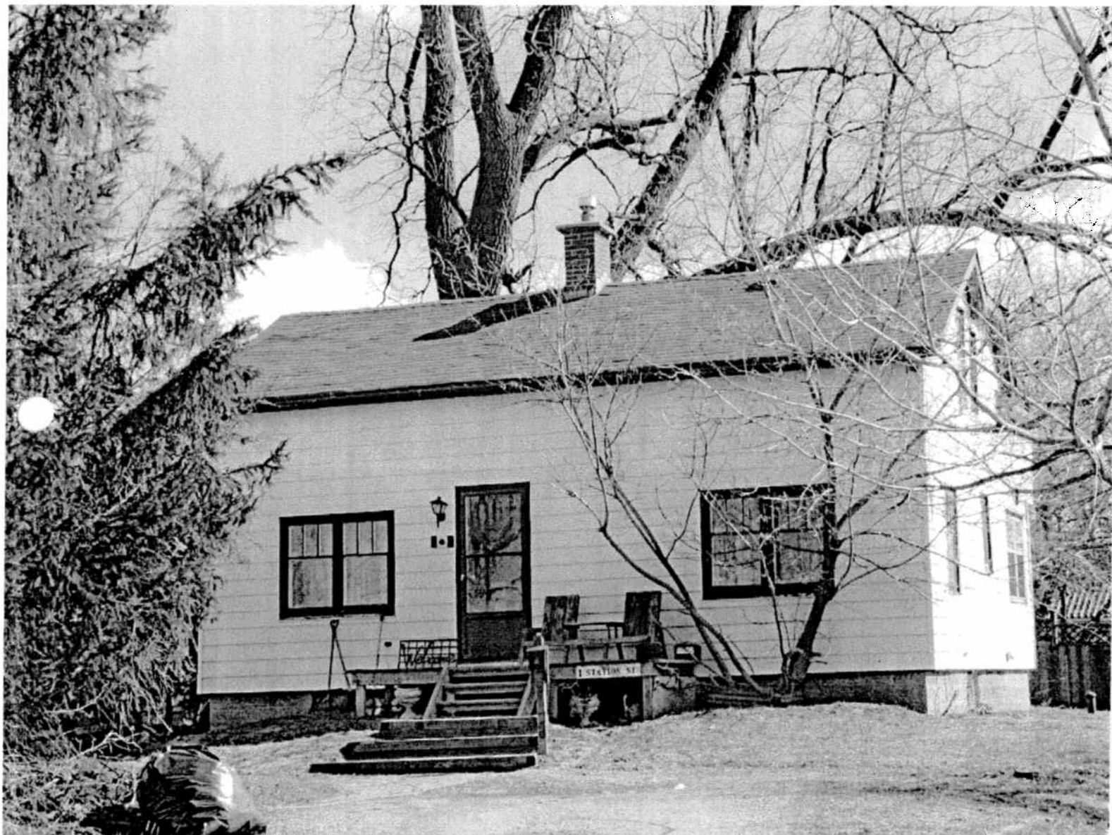
1 STATION STREET