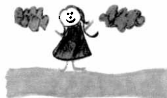
Amanda -- Age 5