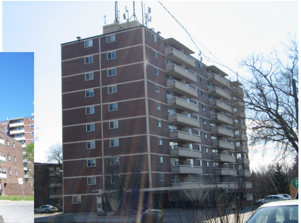
14 Dublin Street (to the northwest)