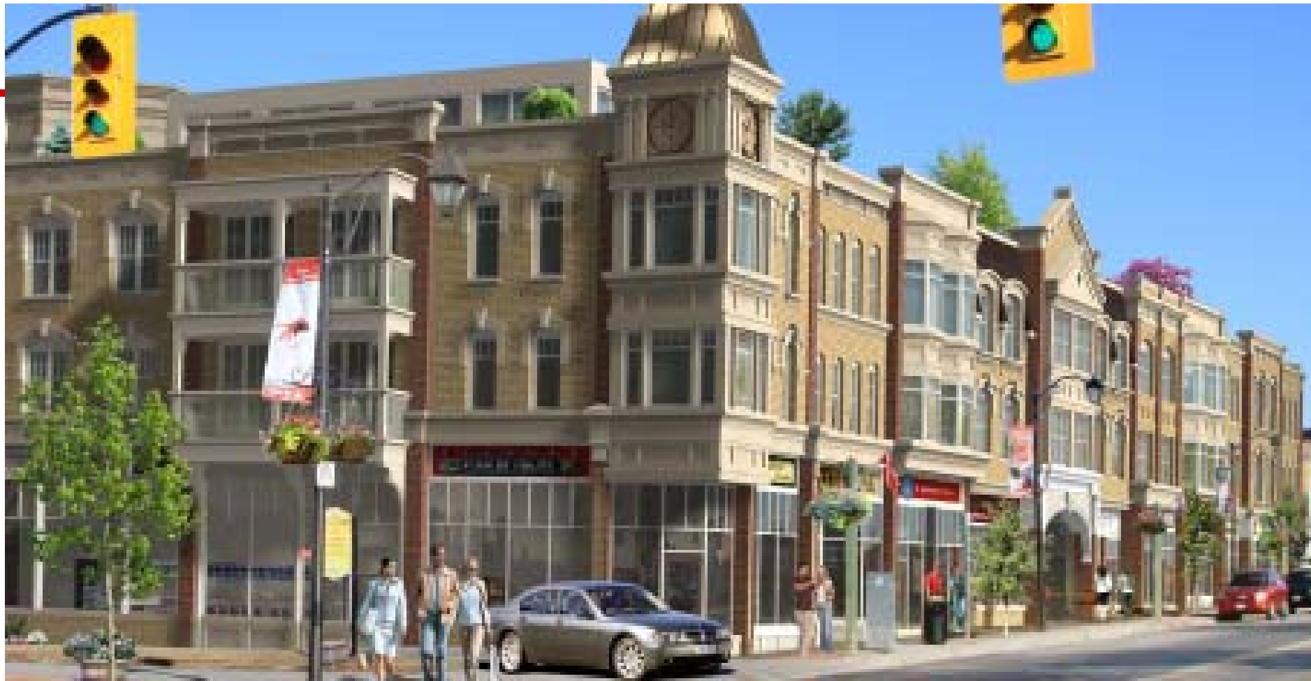
Artist Rendering-Retail Storefronts on Main Street