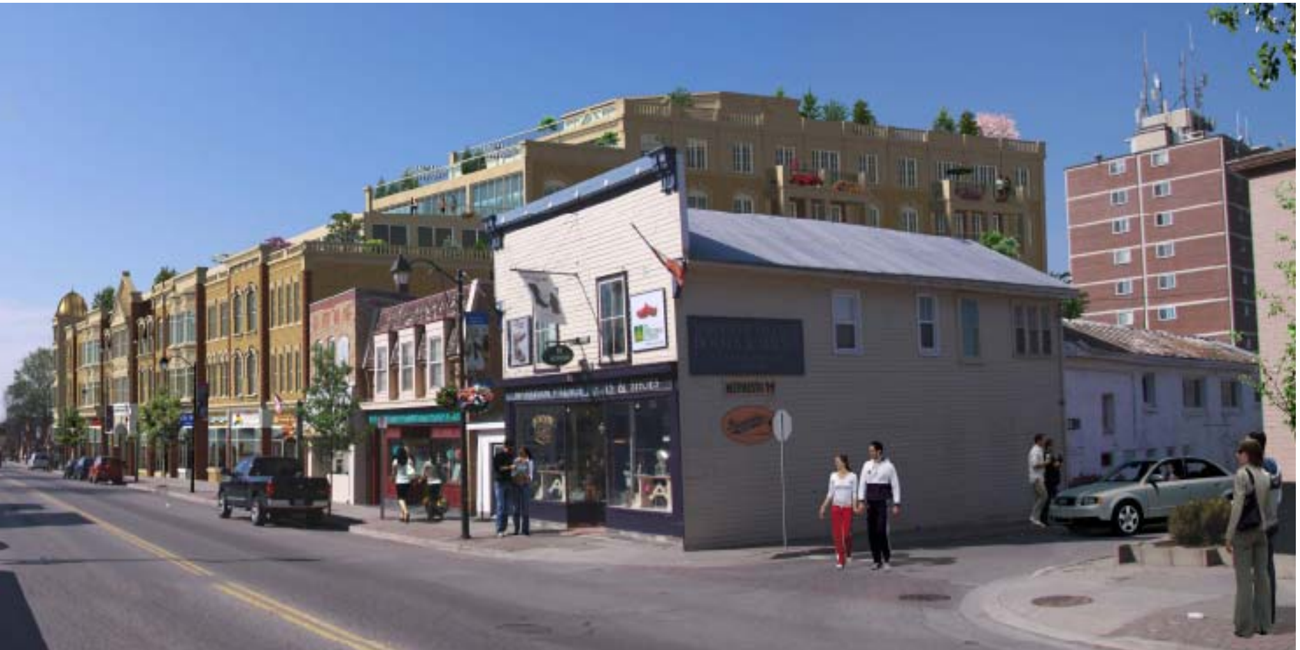
Artist Rendering – Looking South