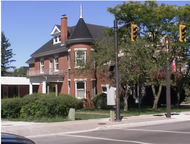
52 Main St N (to the south)