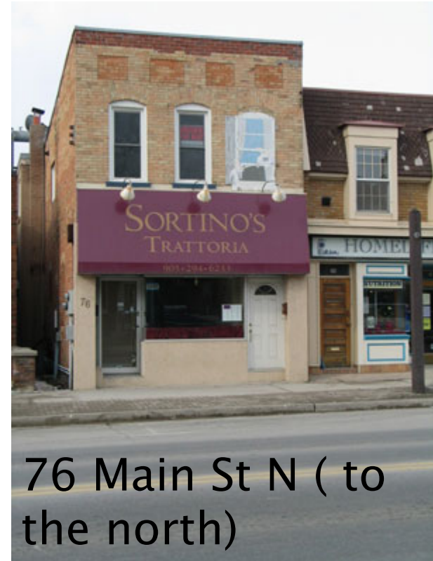
76 Main St N ( to the north)