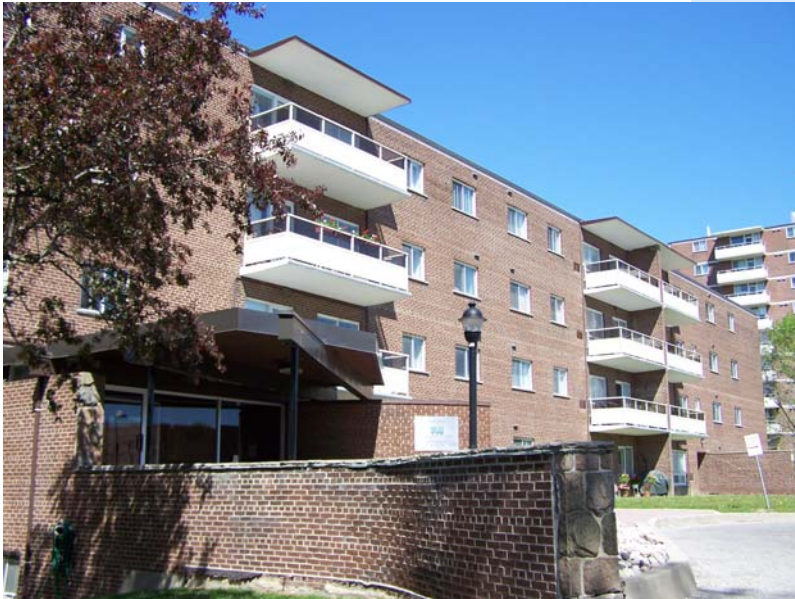
56 Main St N (to the west)