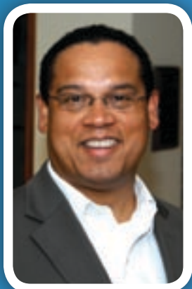
U.S. Congressman Keith Ellison 5th District of Minnesota