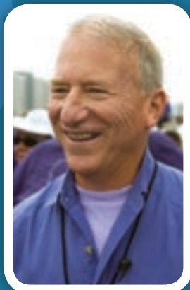
Andy Stern President, Service Employees International Union