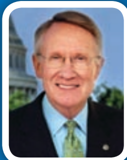
U.S. Senator Majority Leader Harry Reid Nevada Invited