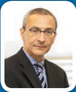
John Podesta President and Chief Executive Officer, Center for American Progress Invited