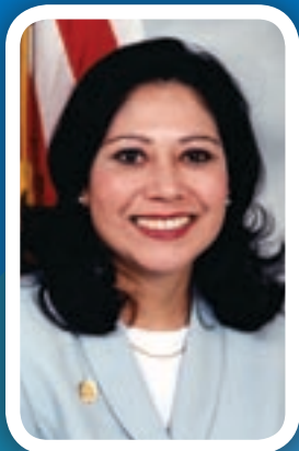
U.S. Congresswoman Hilda L. Solis 32nd District of California Invited