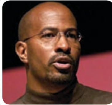
Van Jones Founding President, Green For All