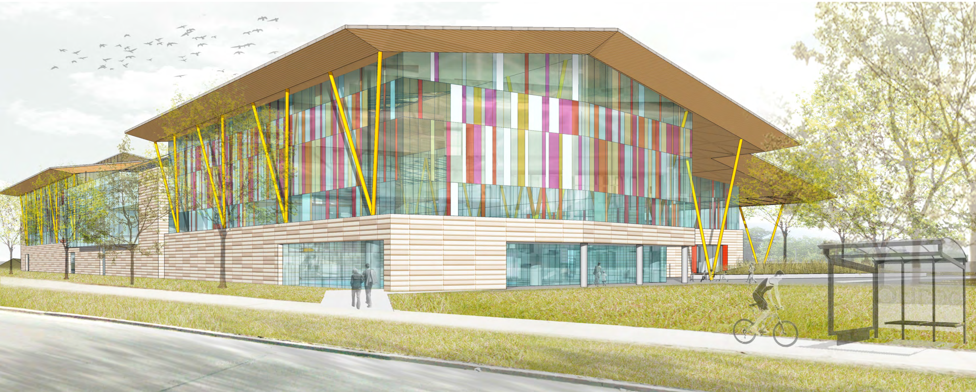
VIEW FROM NORTHWEST ALONG 14 TH AVENUE