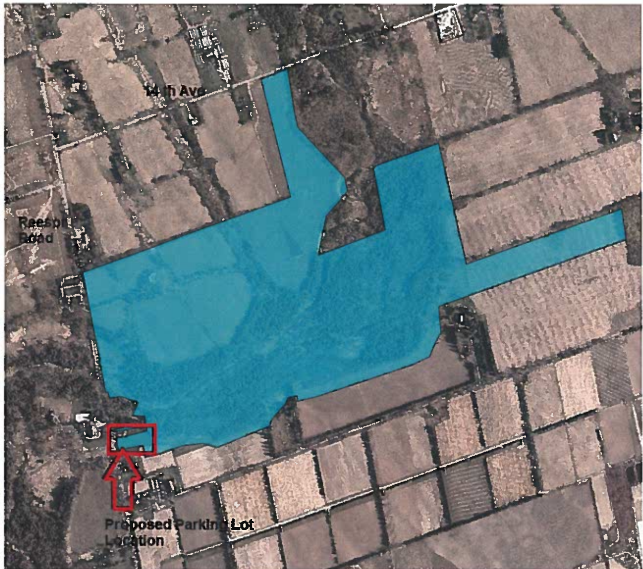
Figure 1 – 7373 Reesor Road Location