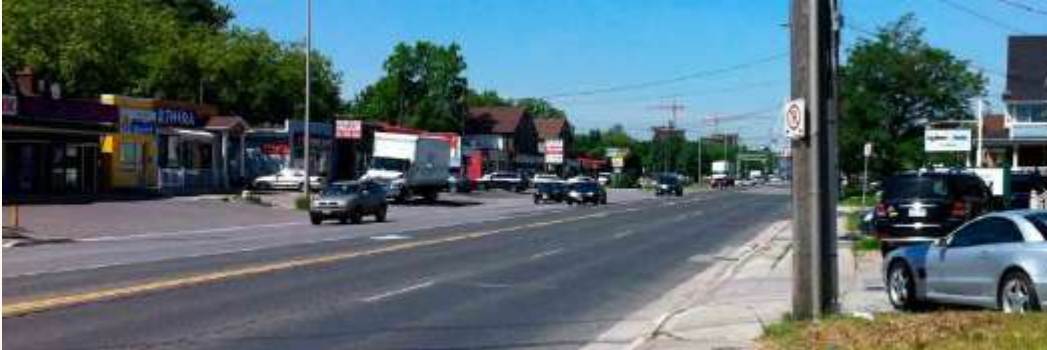
Existing – looking west