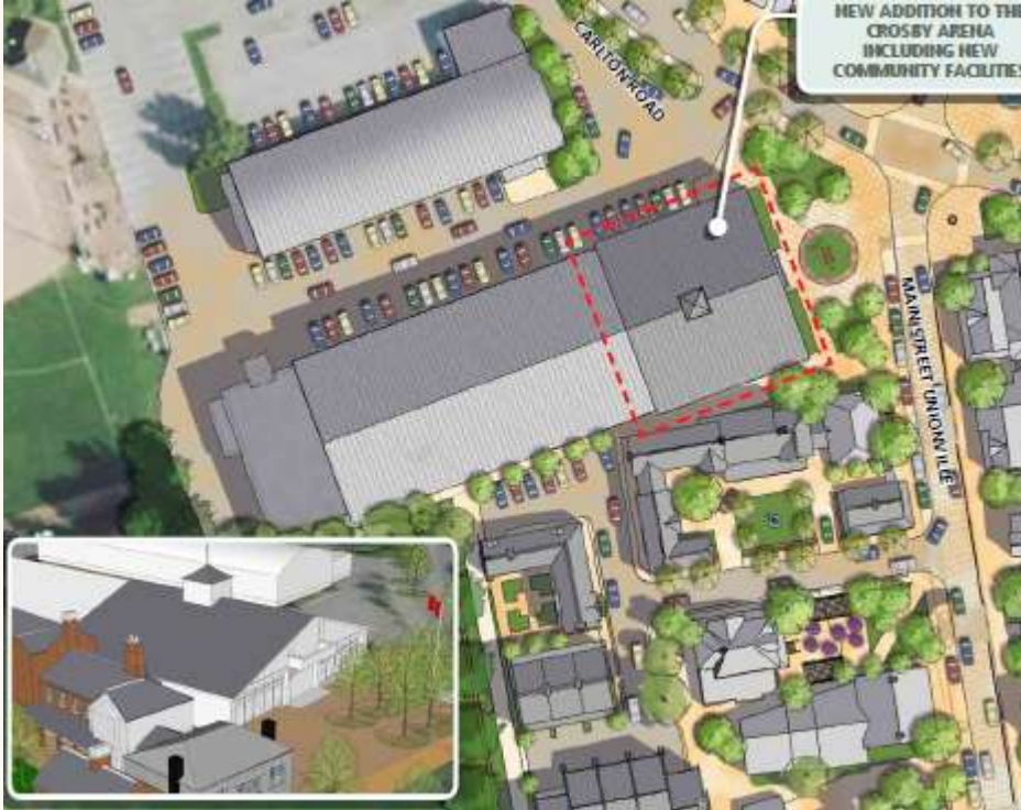
New Front Facade