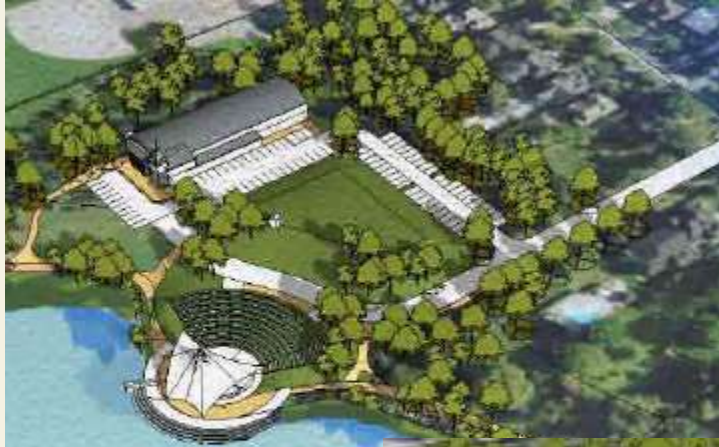
Amphitheatre and Curling Club Option